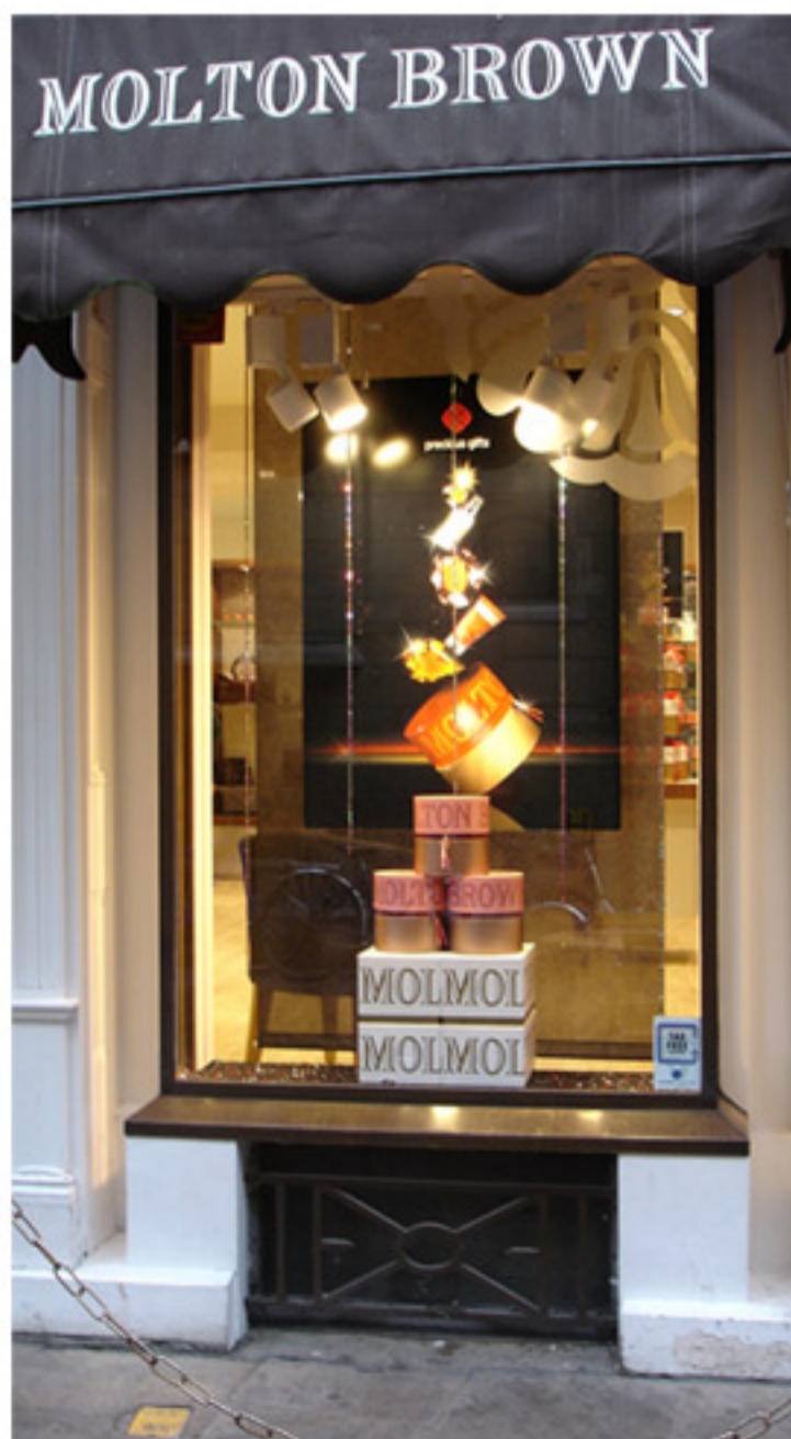
Window Display Rollout

Shop4retail has also utilised it's bespoke design service to rollout a desktop brochure display holder across the stores.